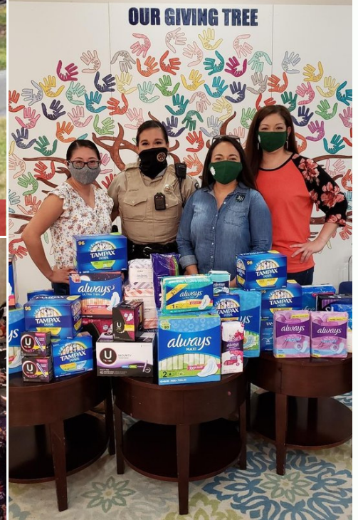
DONE IN A DAY