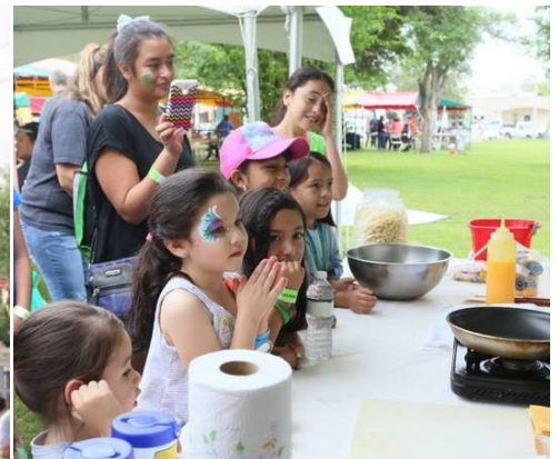
KIDS IN THE KITCHEN